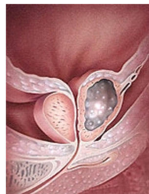
Prostate tumor confined to prostate gland.

I was coming to the conclusion that the average physician might be unduly fearful of the risk of prostate cancer with testosterone therapy. From my lectures to physicians around the country, it became clear to me that many physicians withheld testosterone therapy from their patients because they feared stimulating a sleeping cancer. I thought it might be time to write a review article that put the risks of testosterone in perspective, particularly the risk of prostate cancer. Fortunately for me, the New England Journal of Medicine was receptive to my proposal to consider such a publication.