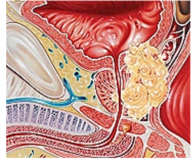
Prostate cancer with infiltration into bladder, lymph nodes, and urethra.

One of the most important and reassuring studies regarding testosterone and prostate cancer was an article published in the Journal of the National Cancer Institute in 2008, in which the authors of eighteen separate studies from around the world pooled their data regarding the likelihood of developing prostate cancer based on concentrations of various hormones, including testosterone. This enormous study included more than 3,000 men with prostate cancer and more than 6,000 men without prostate cancer, who served as controls in the study. No relationship was found between prostate cancer and any of the hormones studied, including total testosterone, free testosterone, or other minor androgens. In an accompanying editorial, Dr. Carpenter and colleagues from the University of North Carolina School of Public Health suggest scientists finally move beyond the long-believed but unsupported view that high testosterone is a risk for prostate cancer.